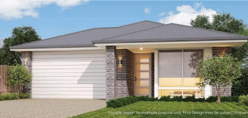
Facade design for example purpose only. Final Design may be subject to change.